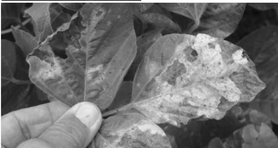
Vein Necrosis Syndrome (VNS)